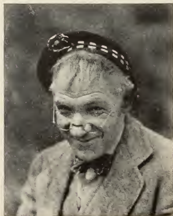
The Famous-Lasky Film Service Ltd.